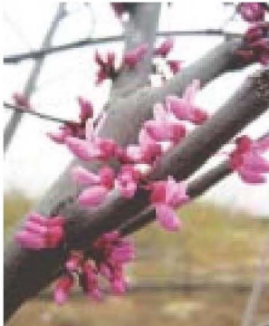
Eastern Redbud (Cercis Canadensis).

Cercis canadensis is commonly known as the Eastern Redbud tree. It is a small single or multi-stemmed deciduous, ornamental understory tree. The tree grows 20 to 30 feet tall and 20 to 35 feet wide.